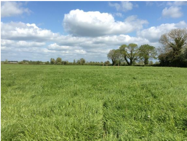
Plate 13: T5, looking E.