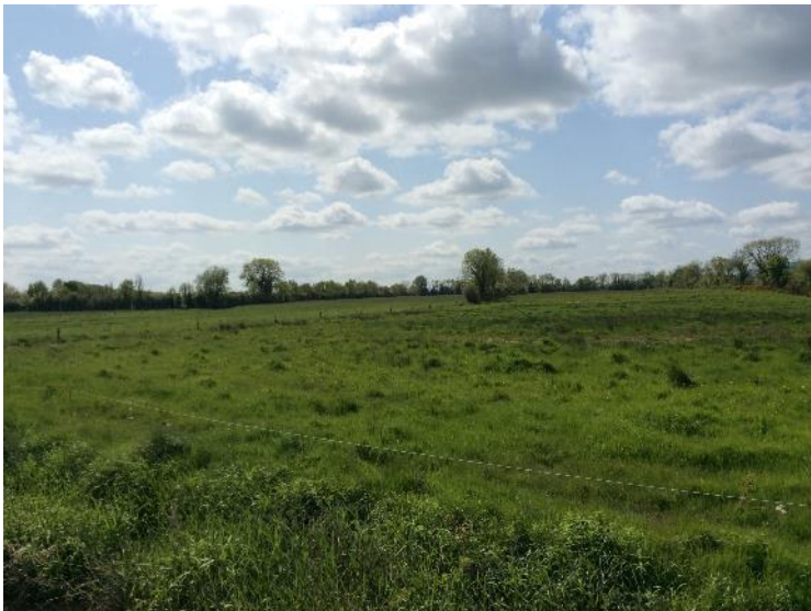
Plate 19: General view of T7, looking SW.