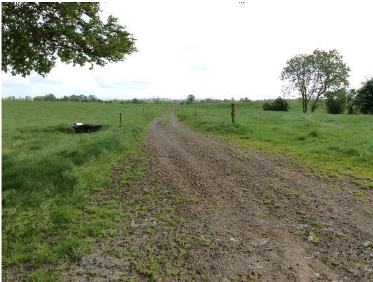
Plate 4: Existing track (due for upgrade) looking NE towards temporary proposed borrow pit.