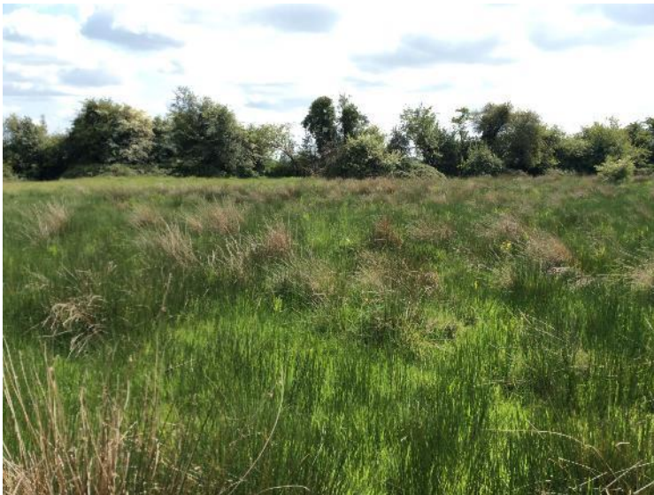
Plate 16: Proposed spoil management area SE of T6, looking SW.