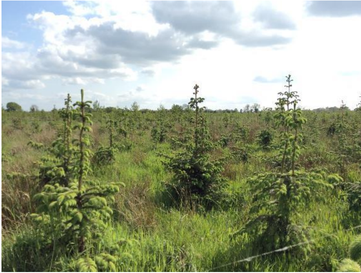
Plate 24: Proposed road to T9 in young coniferous forestry, looking SW.