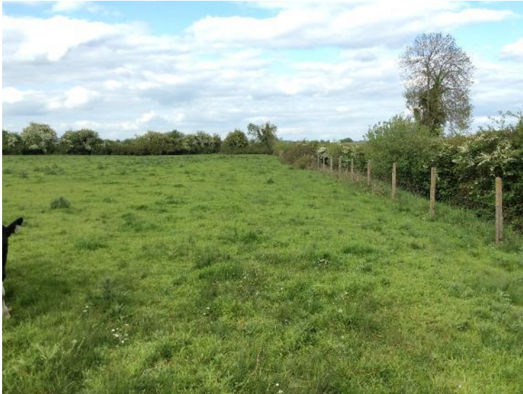
Plate 34: Proposed Grid Connection underground cabling route in pasture, looking NE.