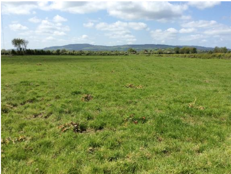
Plate 22: General view of T8 and associated hardstand, looking NW.