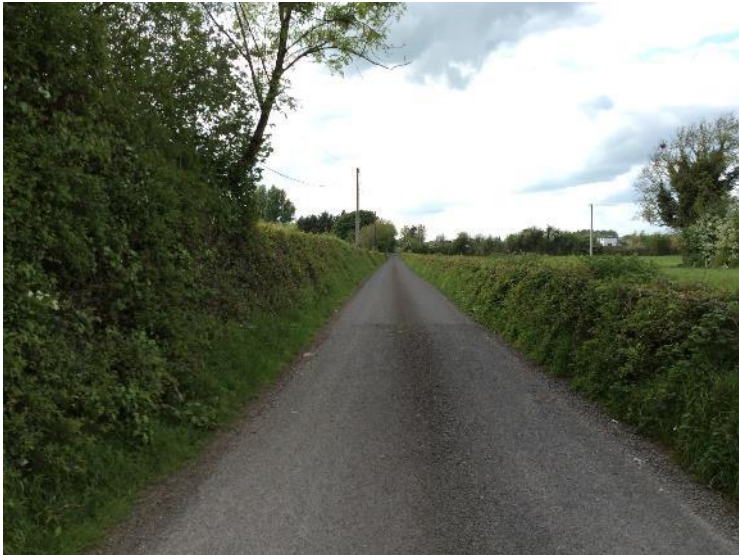
Plate 32: Proposed Grid Connection underground cabling route SE of CHI, looking NW.