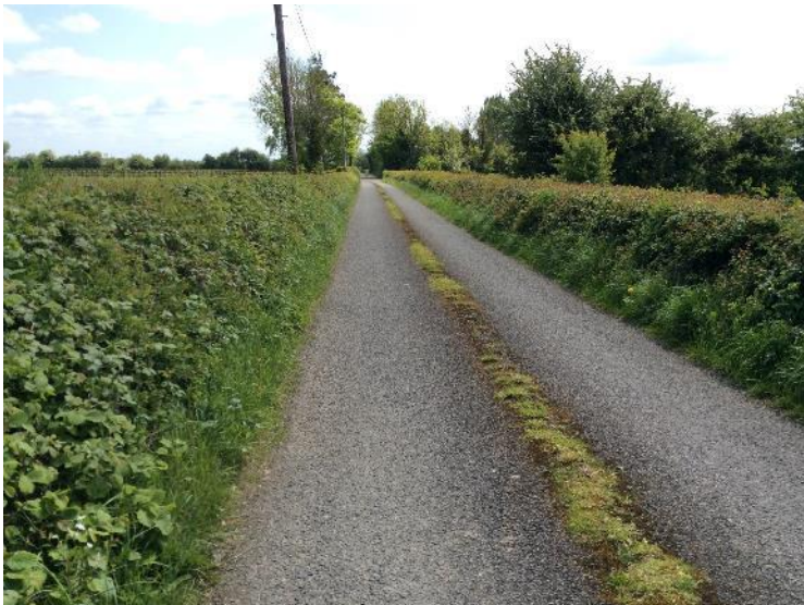
Plate 29: Proposed Grid Connection underground cabling route along public road (L-7039), looking SE.