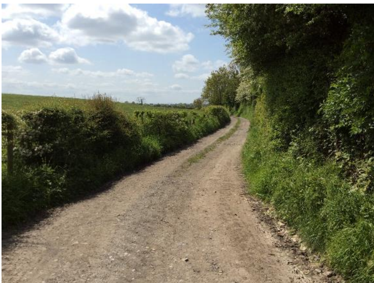
Plate 23: L-70391 east of T8, looking SW.