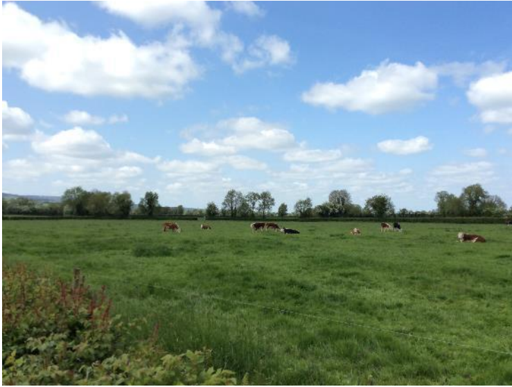
Plate 21: Proposed road between T8 and T5, looking NW.