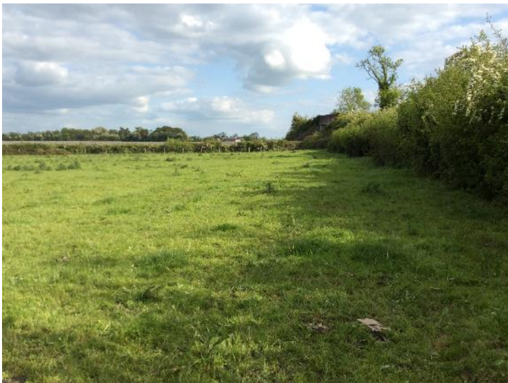
Plate 33: Proposed Grid Connection underground cabling route in pasture to east of public road, looking SE.