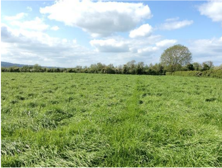
Plate 12: Proposed road to met mast, looking NW.