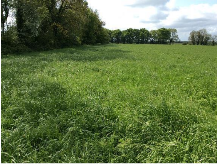
Plate 6: General view of T2, looking S.