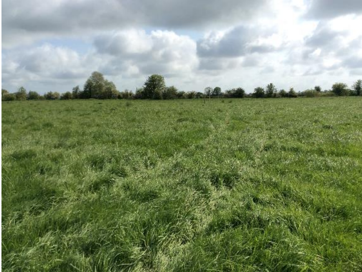
Plate 1: General view of TI, looking NE.