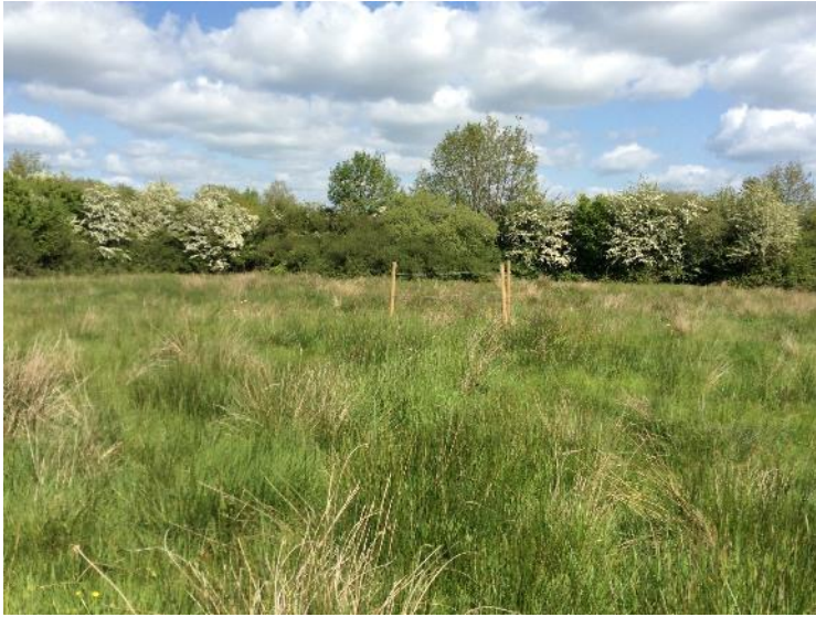
Plate 18: T6, looking NE.