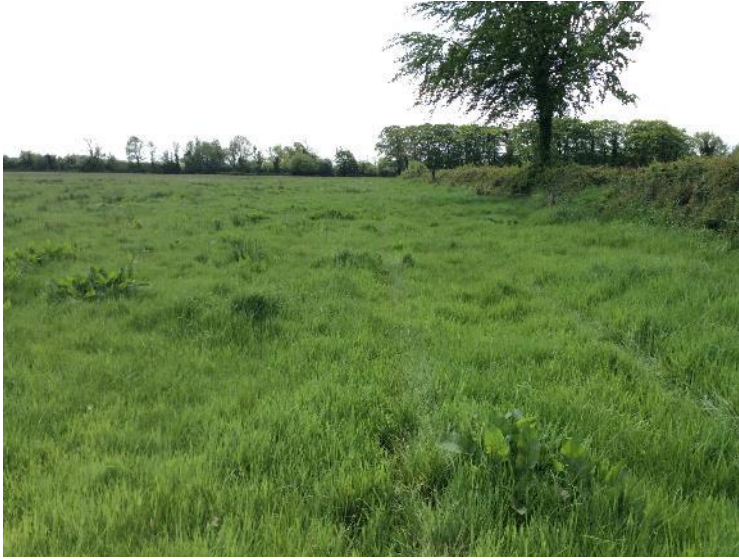
Plate 9: Proposed road to T4, looking S.