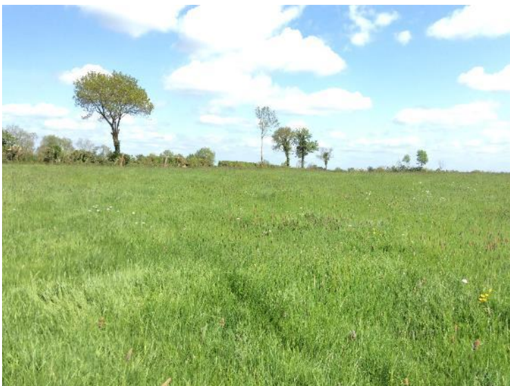
Plate 20: Proposed road between T6 and T8, looking NE.