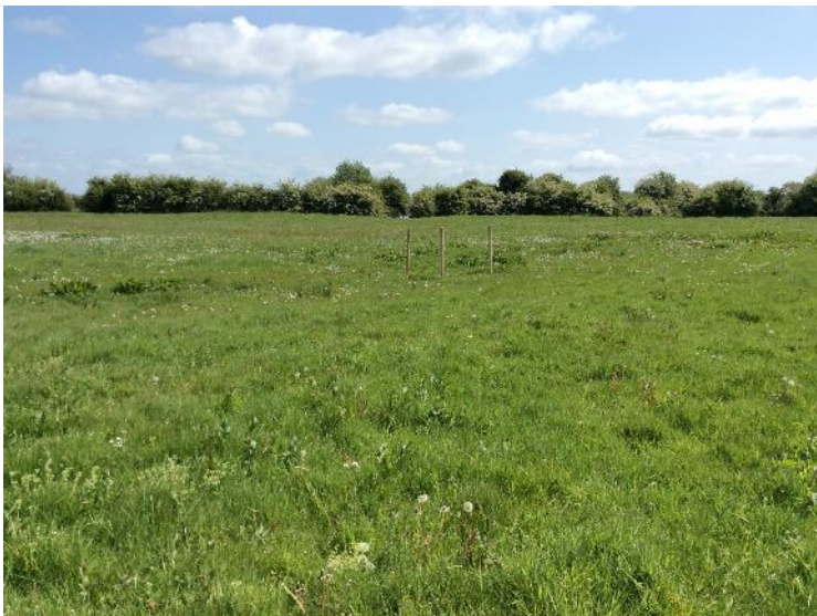
Plate 8: T3, looking E.