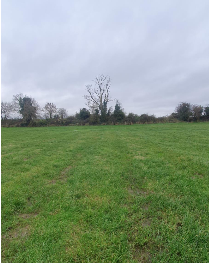
Plate 26: Location of rectangular crop mark, looking N.