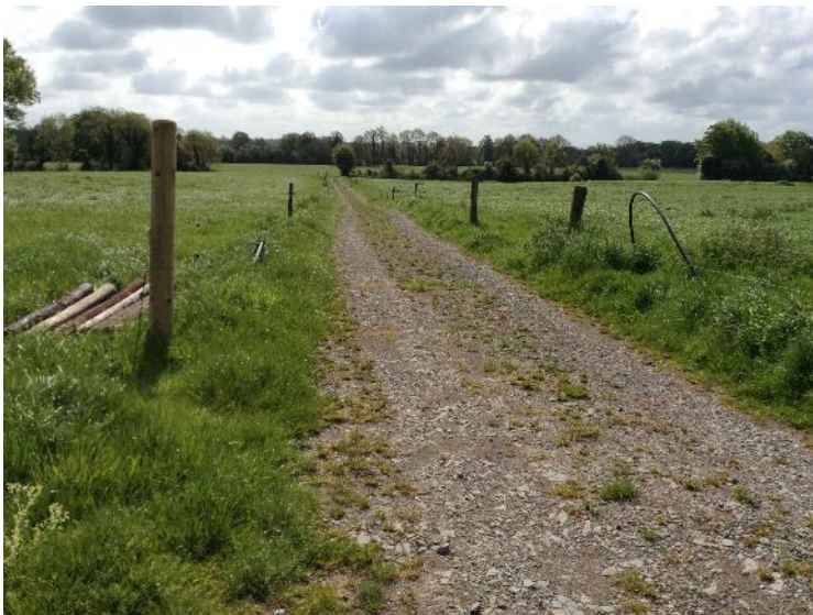
Plate 5: Existing track (due for upgrade), looking SE towards T2.