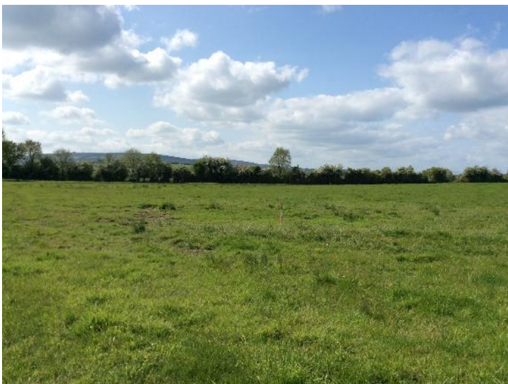
Plate 14: Site of TN029-030— redundant record, west of T5, looking NW.