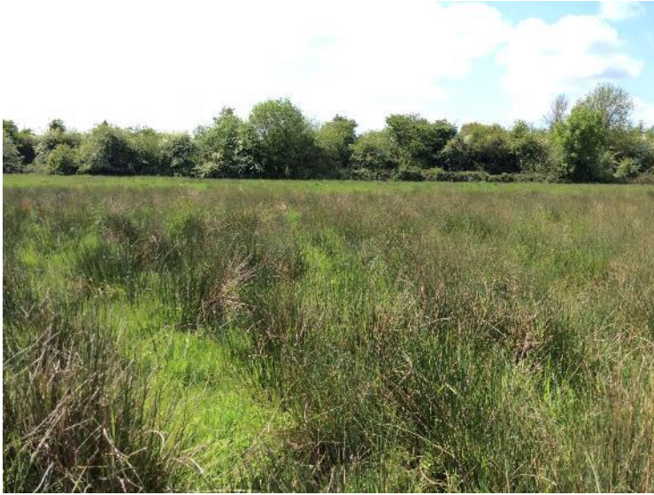
Plate 15: Proposed road to T6, looking W.