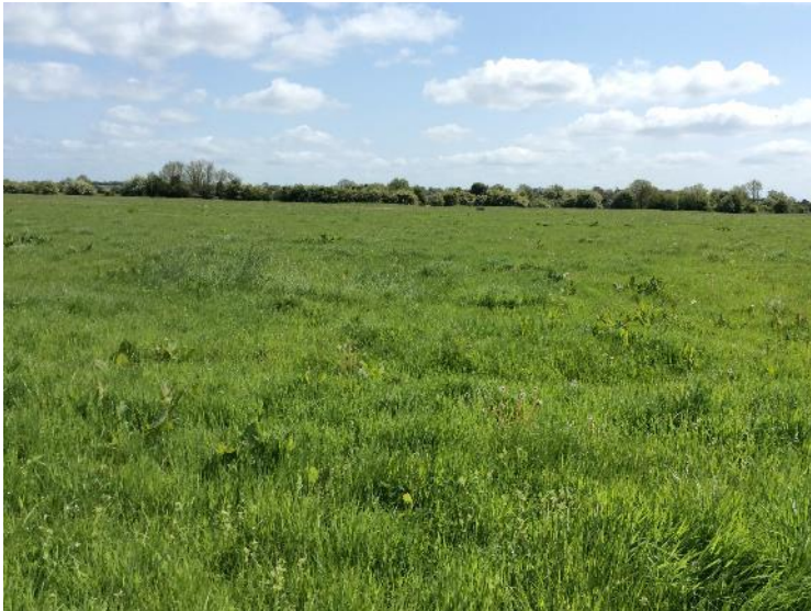
Plate 7: General view of T3 and associated hardstand and access track, looking E.