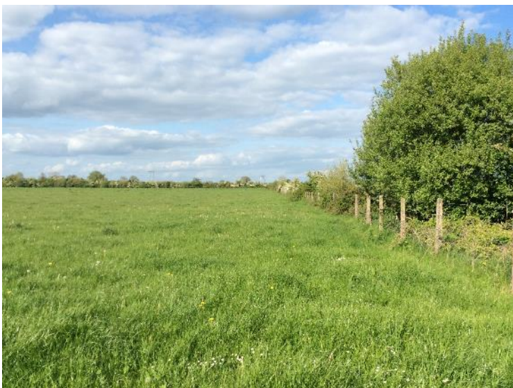
Plate 36: Proposed Grid Connection underground cabling route in pasture further to NE, looking NE.