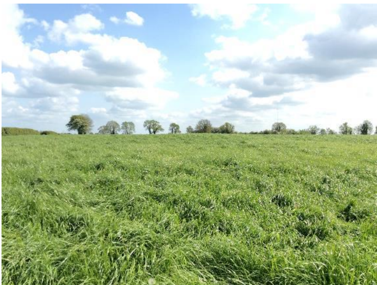
Plate 11: General view of proposed met mast, looking S.