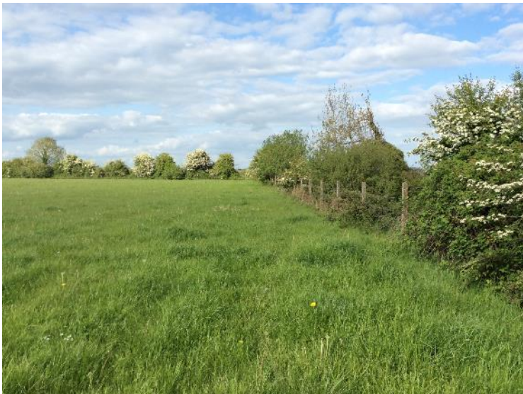
Plate 35: Proposed Grid Connection underground cabling route in pasture further to NE, looking NE.