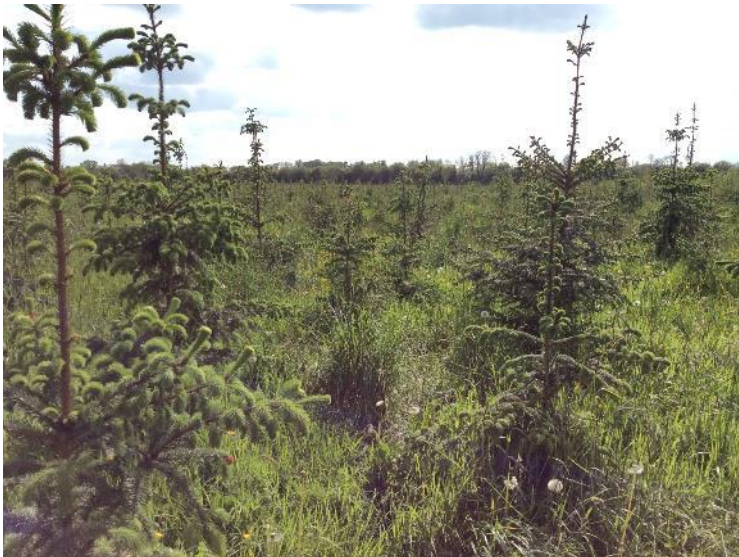
Plate 25: General view of T9 and associated hardstand in young coniferous forestry.