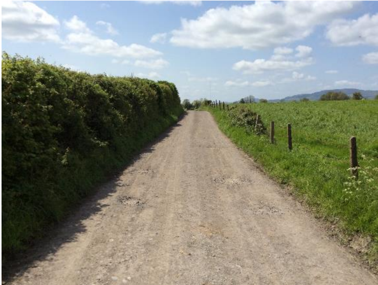
Plate 28: Proposed Grid Connection underground cabling route parallel to L-70391 Local Road to east of proposed substation, looking SW.