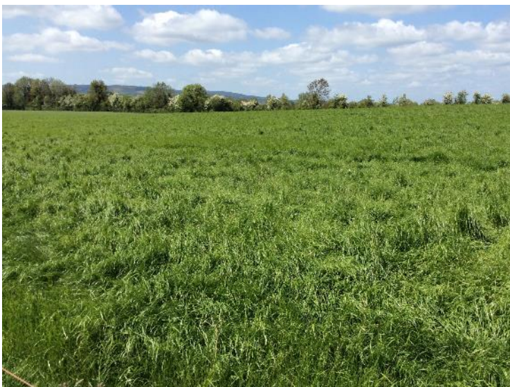
Plate 27: Proposed substation site, looking NW.