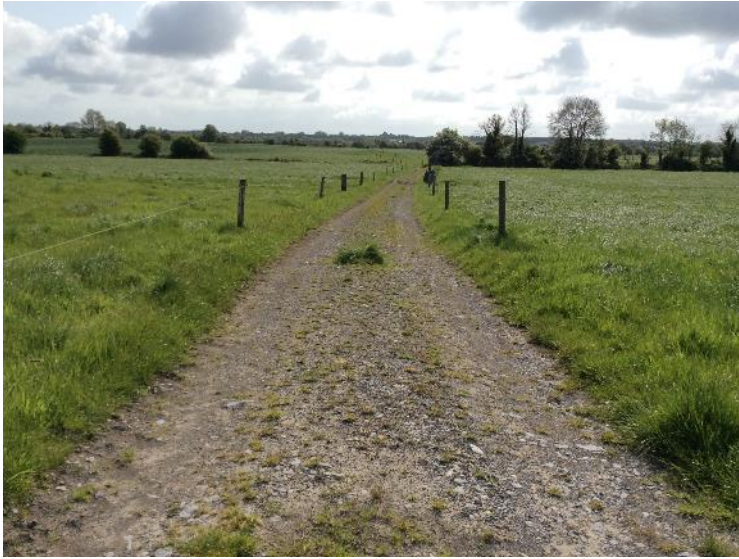
Plate 3: Existing track (due for upgrade) west of T1, looking E.