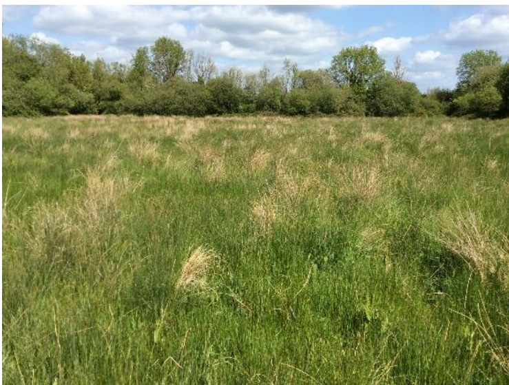
Plate 17: Proposed spoil management area and road to T6, looking ENE.