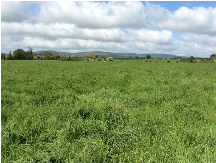
Plate 2: Proposed hardstand for TI, looking W.