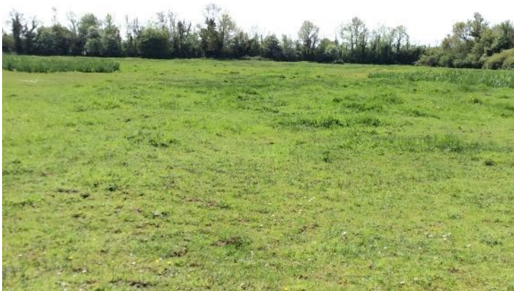
Plate 10: General view of T4 and hardstand, looking SSW.