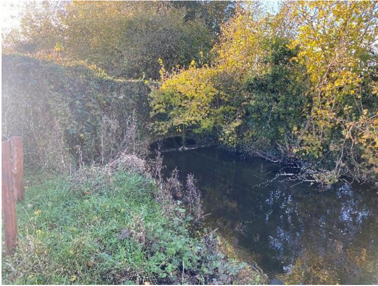
Plate 31: Arch of road bridge CHI.